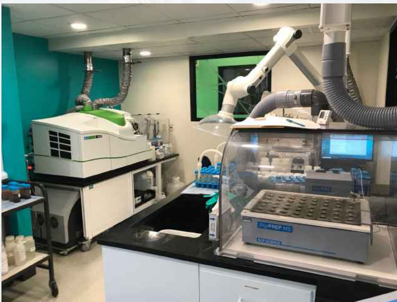
City and County of Broomfield Laboratory

Since going live with Sample Master, both laboratories at the City and County of Broomfield, CO have been very happy with the LIMS. ATL provides both laboratories with excellent technical support and maintains a regular schedule of formal classroom and web-based training options, in addition to their annual Sample Master LIMS Boot Camp.