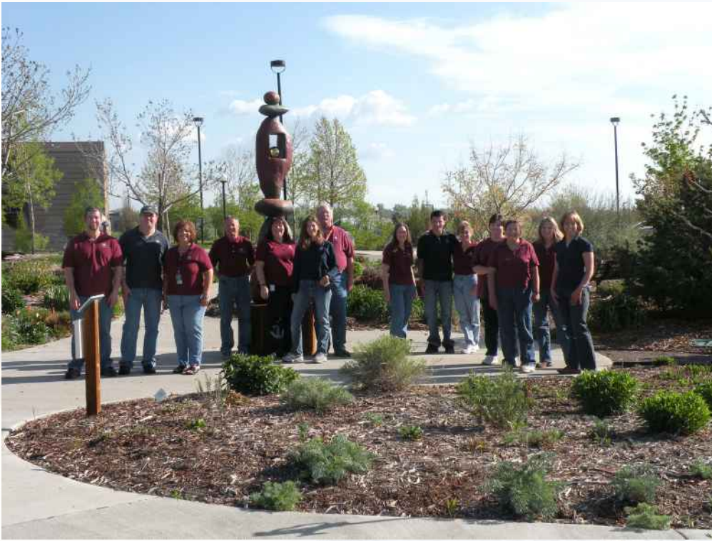
City and County of Broomfield (CO) Environmental Services Staff

“Sample Master has been a great addition to both of the laboratories at the City and County of Broomfield. It has helped us collaborate between the two laboratories, reduce duplication of efforts and eliminate errors with the ability to import results directly from the instruments.”